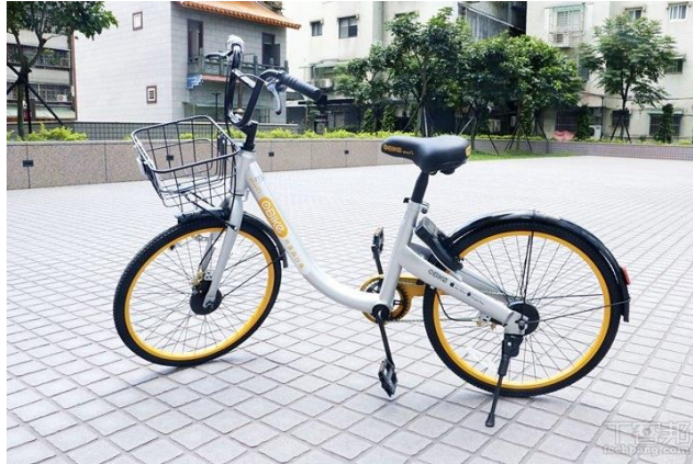
The school gate OBike bicycle